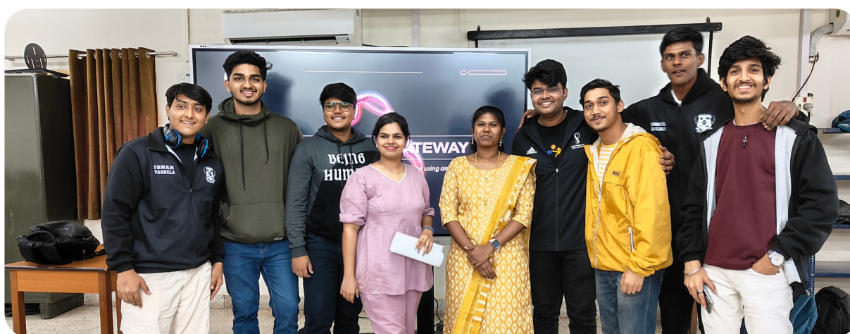
Event “Building the Gateway”