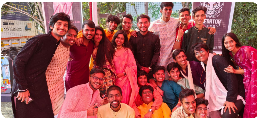
Post Event Image