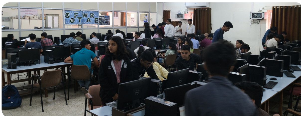
Event “Coders ka Tyohaar”