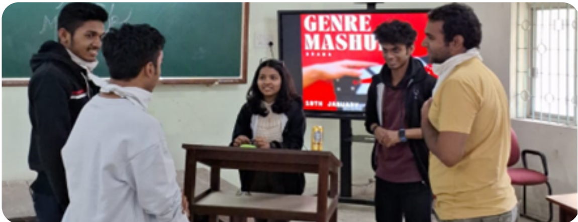
Event "Genre Mashup"